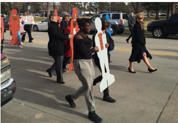
Students raise awareness for Zonta Says NO to Violence Against Women

The Silent Witness display remain at the Laramie County Library through December 10. The Activism Against Gender Violence campaign was from November 25-December 10 and is be devoted to fighting all forms of gender-based violence.