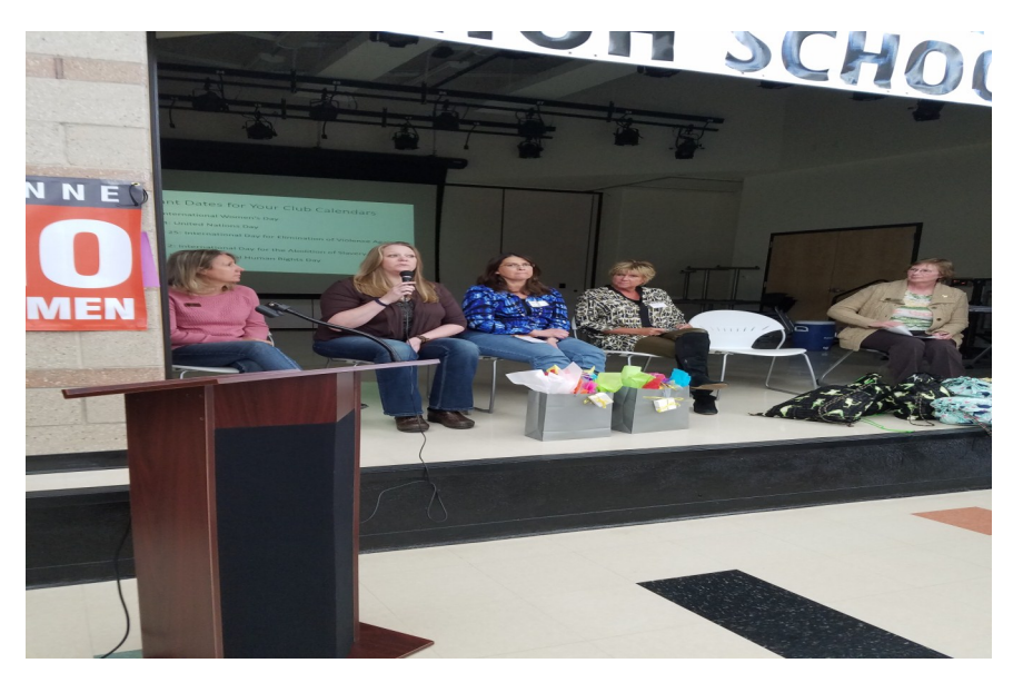
Area 2 Presidents panel on Advocacy in their Clubs