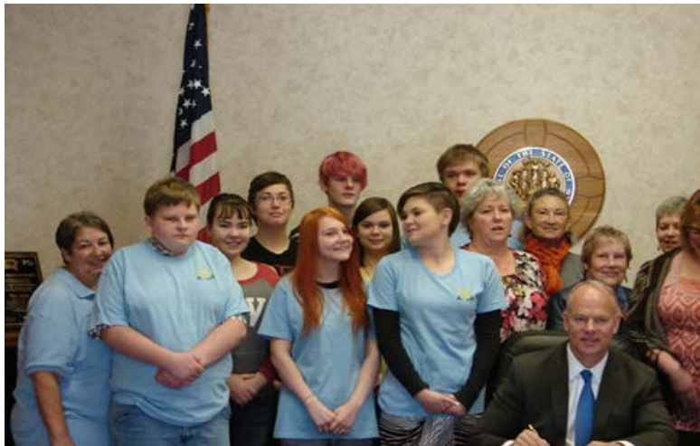
Students from Triumph High School Z Club and Zontians meet with Wyoming Governor Matt Mead as he signs a Proclamation supporting 16 Days of Activism Against Gender Violence on November 23, 2016.