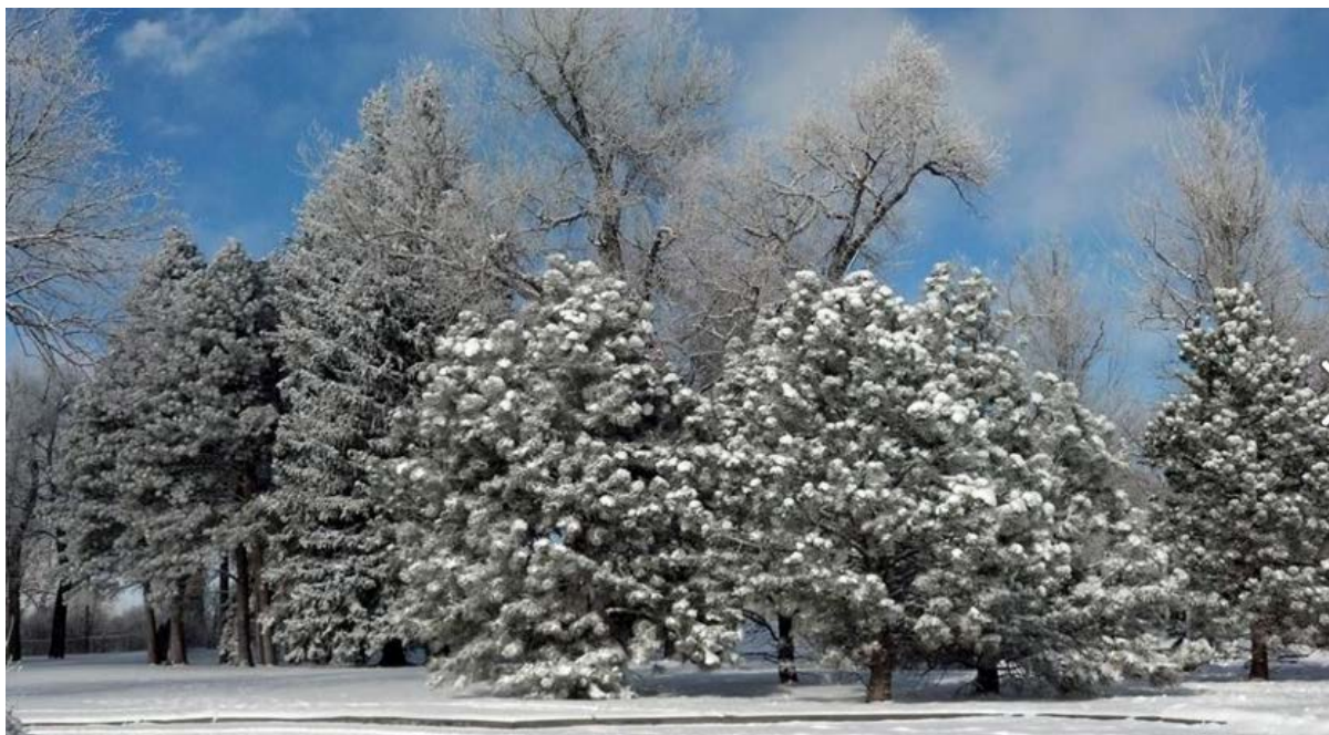
Winter Wonderland in Lions Park

SELL YOUR ZLNO TICKETS OR GIVE THEM AS GIFTS!!