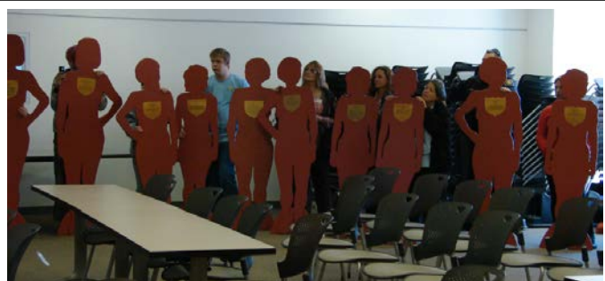
Preparing to process with silhouettes and place in Laramie County Library, Joseph O'Mahoney Federal Bldg, City Hall, and Grace United Methodist Church