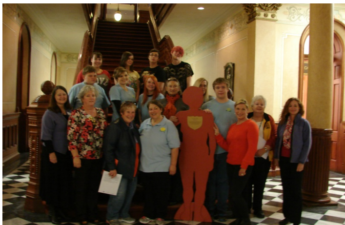
Zontians & Triumph Z-Club at State Capitol 11/23/2015