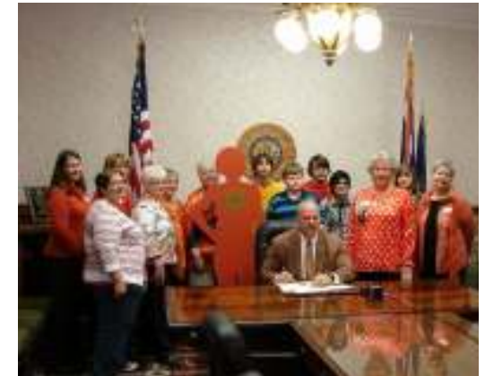
Signing of the Proclamation for the 16 Days of Activism Against Gender Violence with Governor Mead in November 2014.