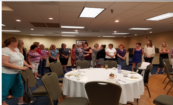
District 12 Leadership Team to Cheyenne

July 20, 1942 - The first class of Women's Auxiliary Army Corps (WAAC) begins at Fort Des Moines, IA