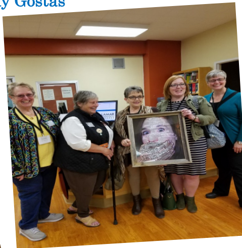
Picture donated to Domestic Safety Resource Officer in Lamar Co

District 12 Conference 2019 will be in Billings Montana September 20th– 22nd 2019