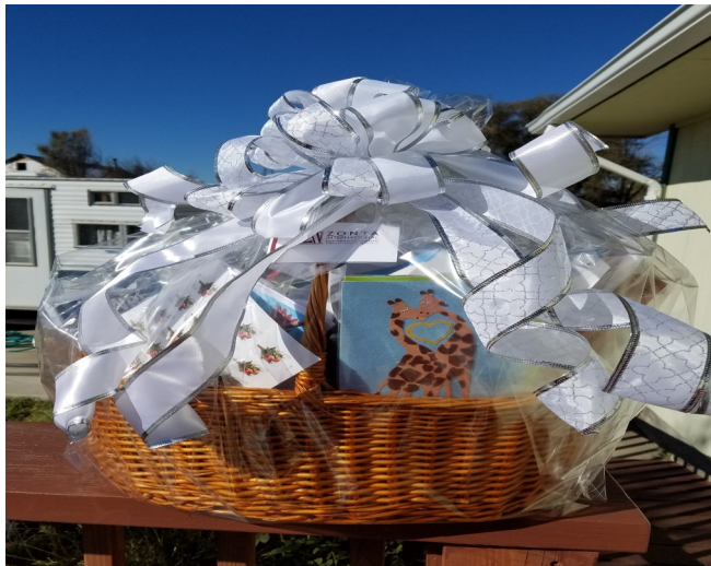
Book Lovers Bash Basket