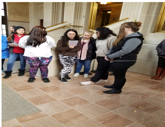
Triumph High School students