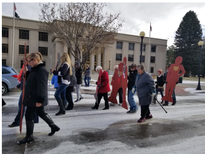
March to Library