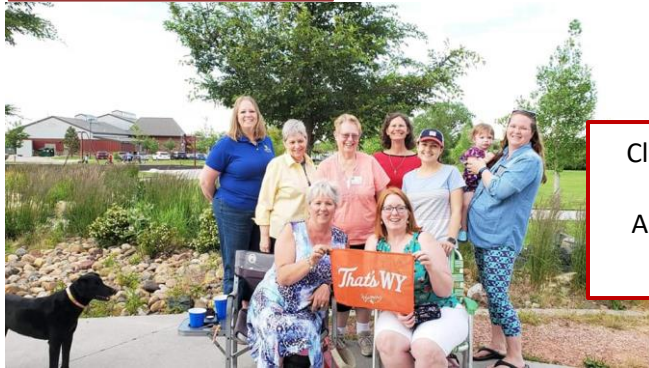
Club’s Summer picnic at Romero Park - A very busy time of the year!