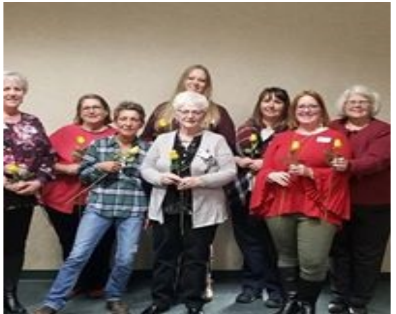
Club officers & board directors.