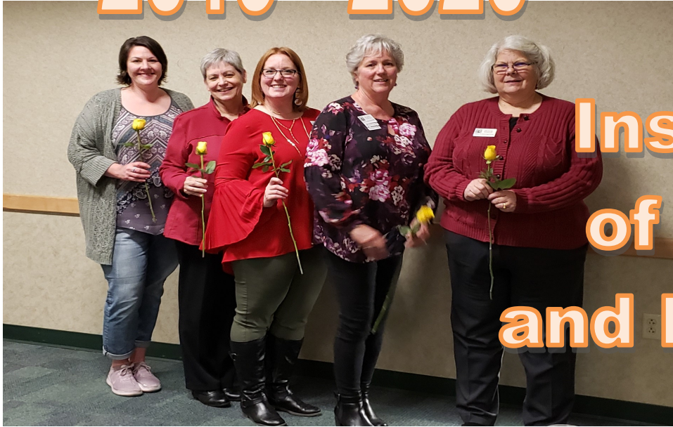
Foundation board of directors.