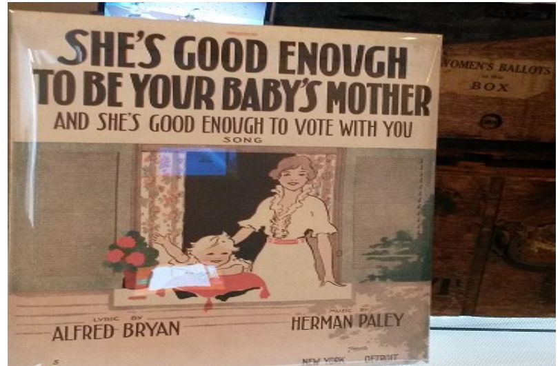
ERA—Equal Rights Amendment Poster

Place: Align Training Center 1401 Airport Pkwy Ste. 300