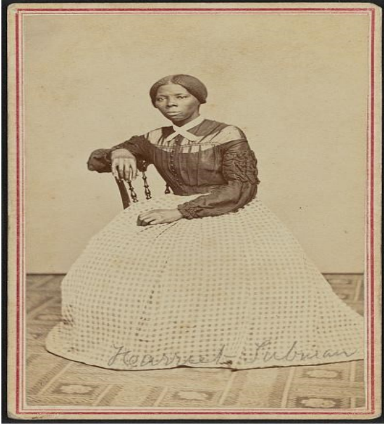
Harriet Tubman 1820-March 10, 1913

Tubman was born into slavery in Eastern Maryland sometime between 1820 and 1821.