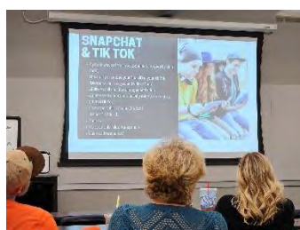
2024 Uprising HT Workshop sponsored by Zonta