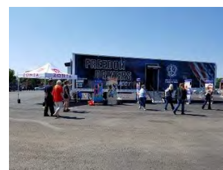
Truckers Against Trafficking Display at CFD