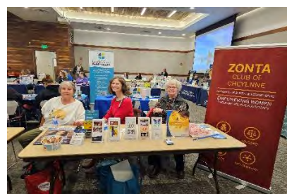
2024 Women's Fair at LCCC