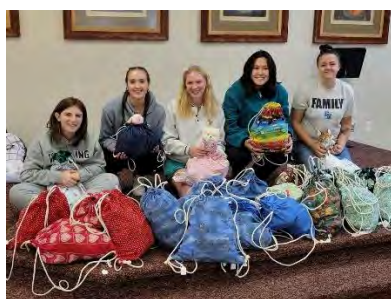
Hope Bag Helpers 2022