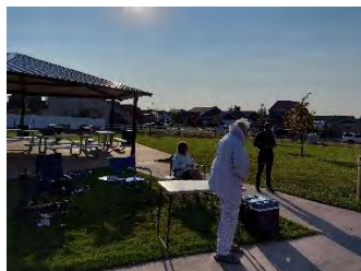
Watch for Traffic 5K