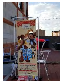
Pancake Breakfast Booth