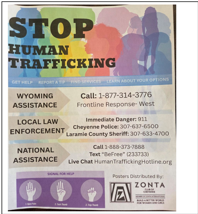
Zonta's CFD project, Coasters and Posters, to help eliminate domestic violence and human trafficking.